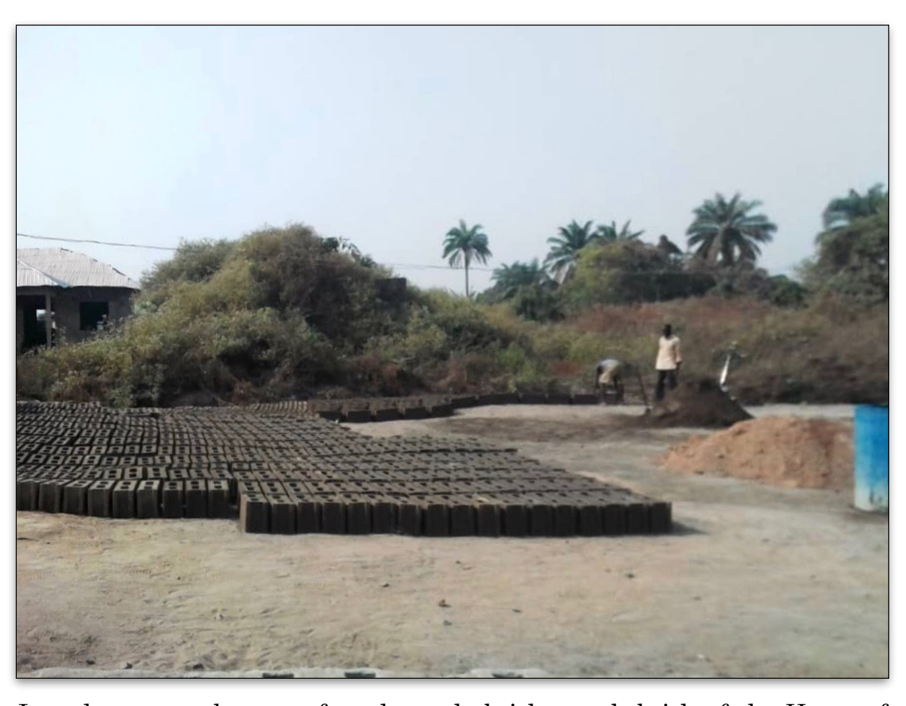
In order to cut the cost of ready made bricks, each brick of the House of Amen is handmade.