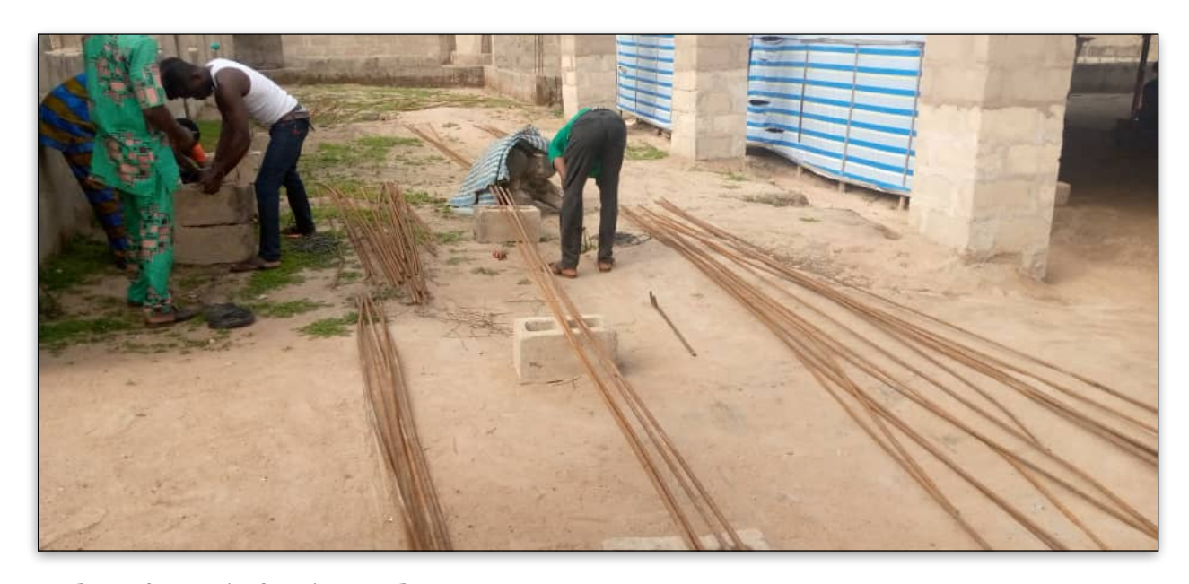
Rebar for reinforcing columns.