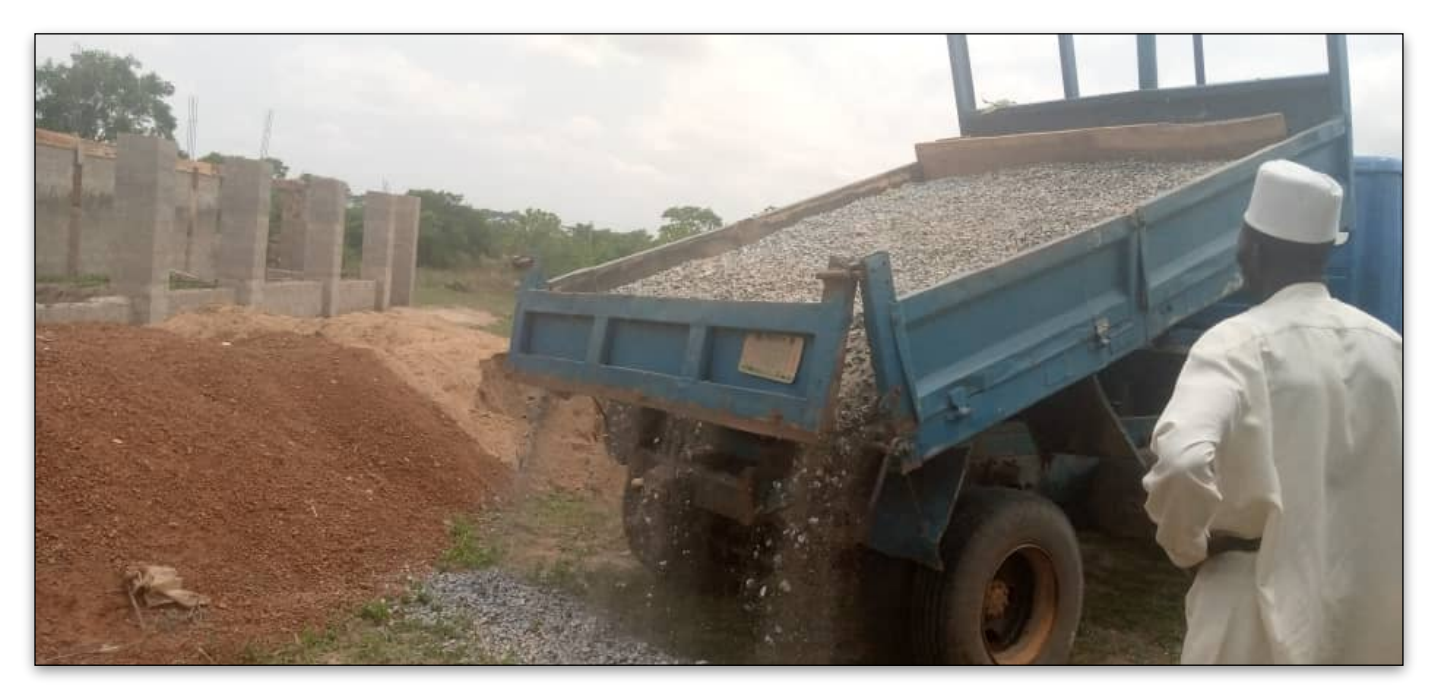
The Lory delivers more granite for the concrete.

The lower picture shows how the wood was used to hold the poured concrete in order to tie the sections of wall together.