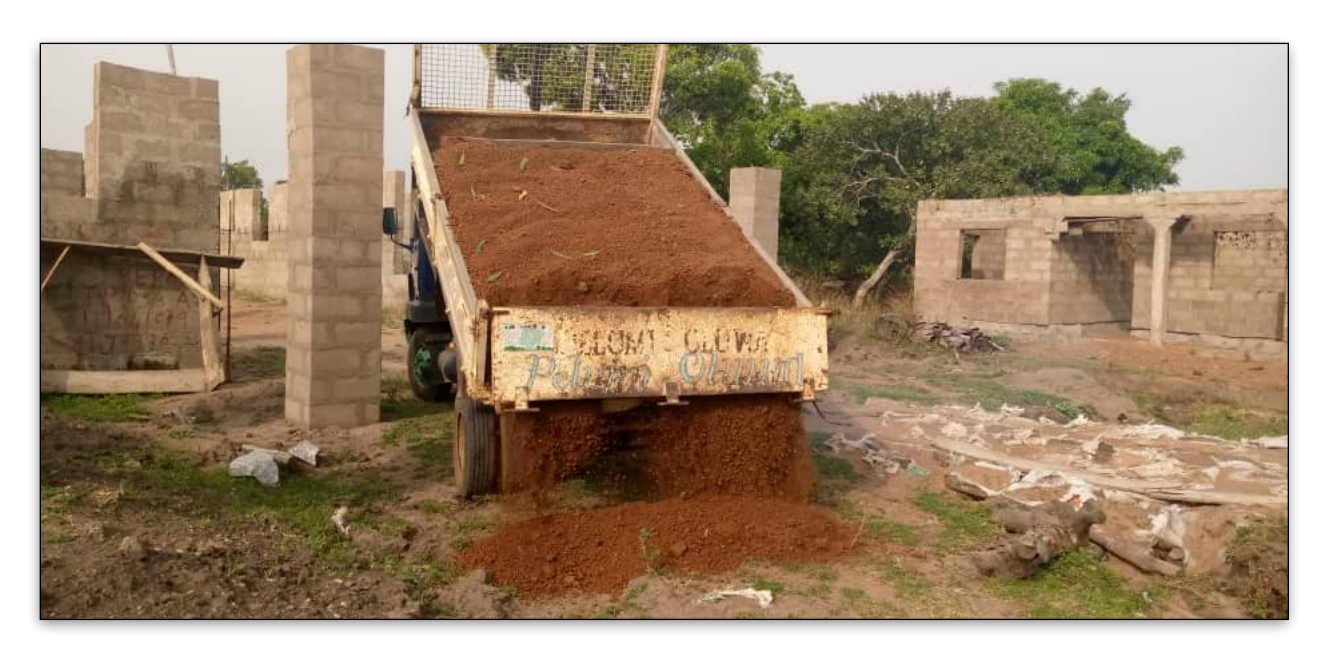
The Lory delivers sand for the concrete.