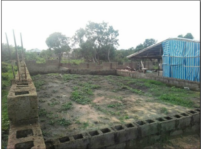
He and his people dug the foundation and then poured the concrete, not by any heavy machinery that we are accustomed to, all mixed and poured by hand.