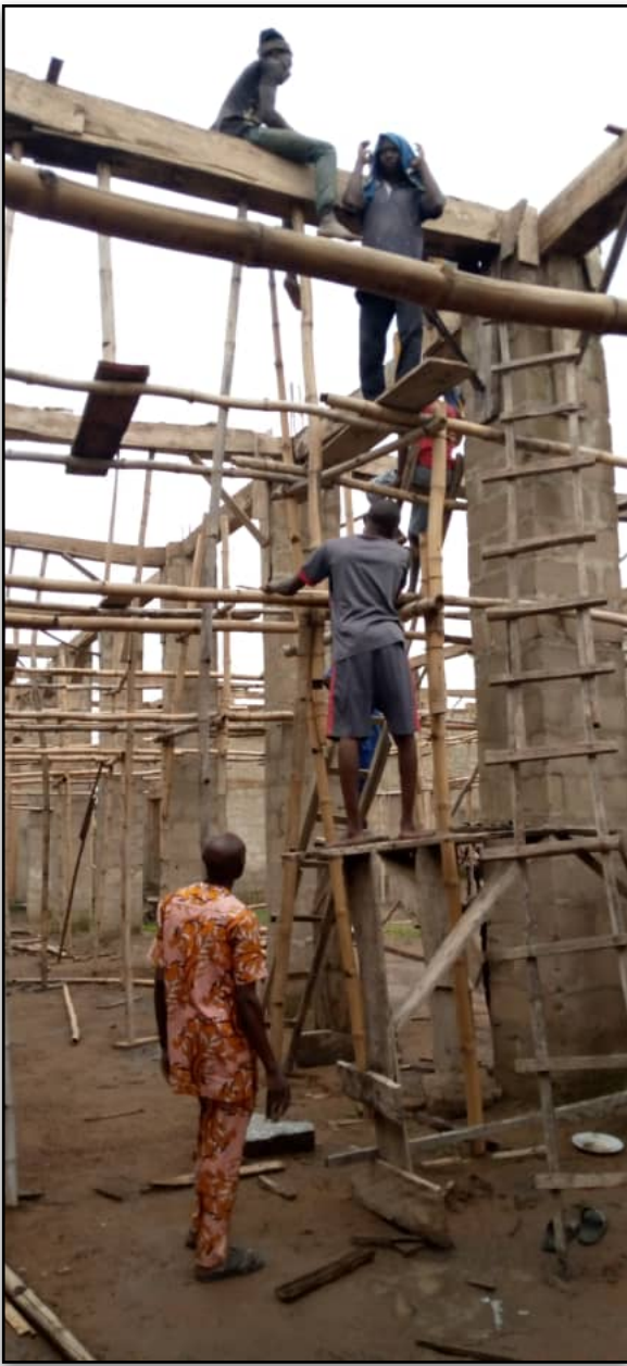
A city of scaffolding.