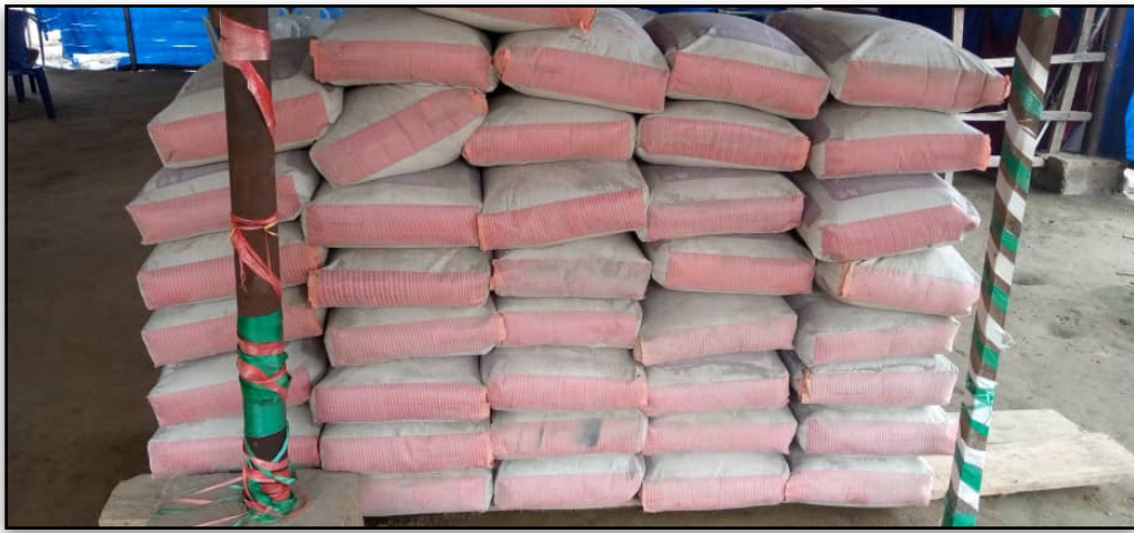
Loaded down with bags of concrete and homemade bricks, the final columns pushed through the temporary House of Amen.