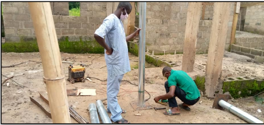
Metal poles were bought to add strength to the altar area.