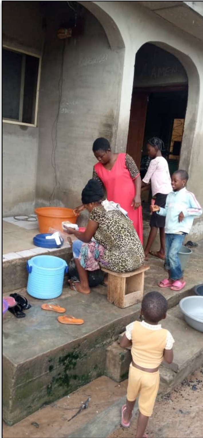
Dinner for everyone !