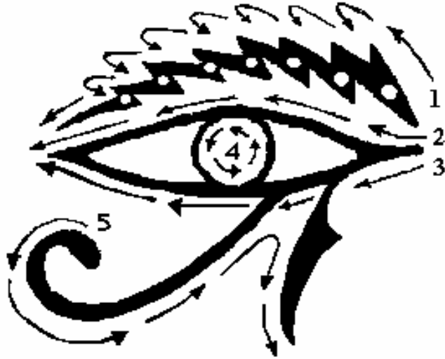
Eye of Melchizedek

The Eye of Melchizedek is drawn and used for the healing of the subtle body and for the clearing of the auras and pranas of the body.